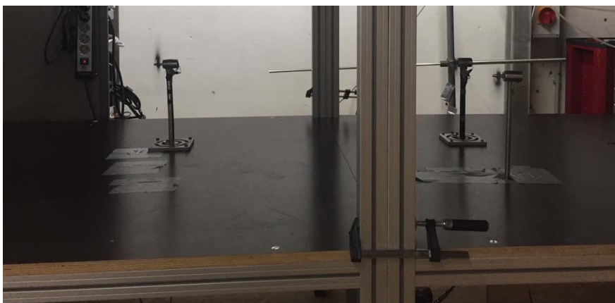
Figure 2. Three-turbine arrangement in the semi-open tunnel with fixed turbines.

The experiment took place in the semi-open wind tunnel at ForWind, University of Oldenburg. Eleven total arrangements of the wind turbines were used. For the fixed turbine cases, the arrangements consisted of 2 or 3 turbines to investigate wake interactions with spacing between the turbines of 2D and 4.5D in the spanwise and streamwise direction, respectively. Figure 1 shows one of the three turbine arrangements in the tunnel. The arrangements were then rotated by 10 and 20 degrees to investigate the effect of incident angle of the wind. Passive and active grids were used for each arrangement for inflow with two different turbulent intensities. Eleven hot-wires, at various locations in the spanwise direction and behind the hub of the turbines in the wall-normal direction, collected data at one, three, and five diameters downstream, as shown in Figure 2.