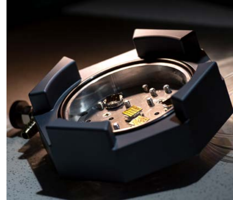
Tiny gold-coated silicon plates smaller than a fingernail are used as a printing surface.

are aimed at preventing unwanted vibrations. The lamps in the lab are also battery-powered because the electromagnetic fields produced by alternating current from a socket would interfere with the tiny electrical currents and voltages needed to control the nanoprinting process.