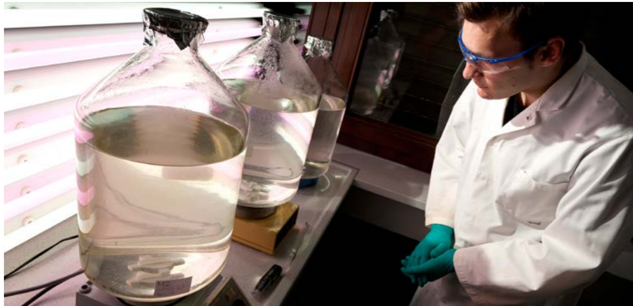
A team of five researchers and several students participated in the laboratory experiment. The samples were prepared and analysed using ultra-high resolution chemical methods.