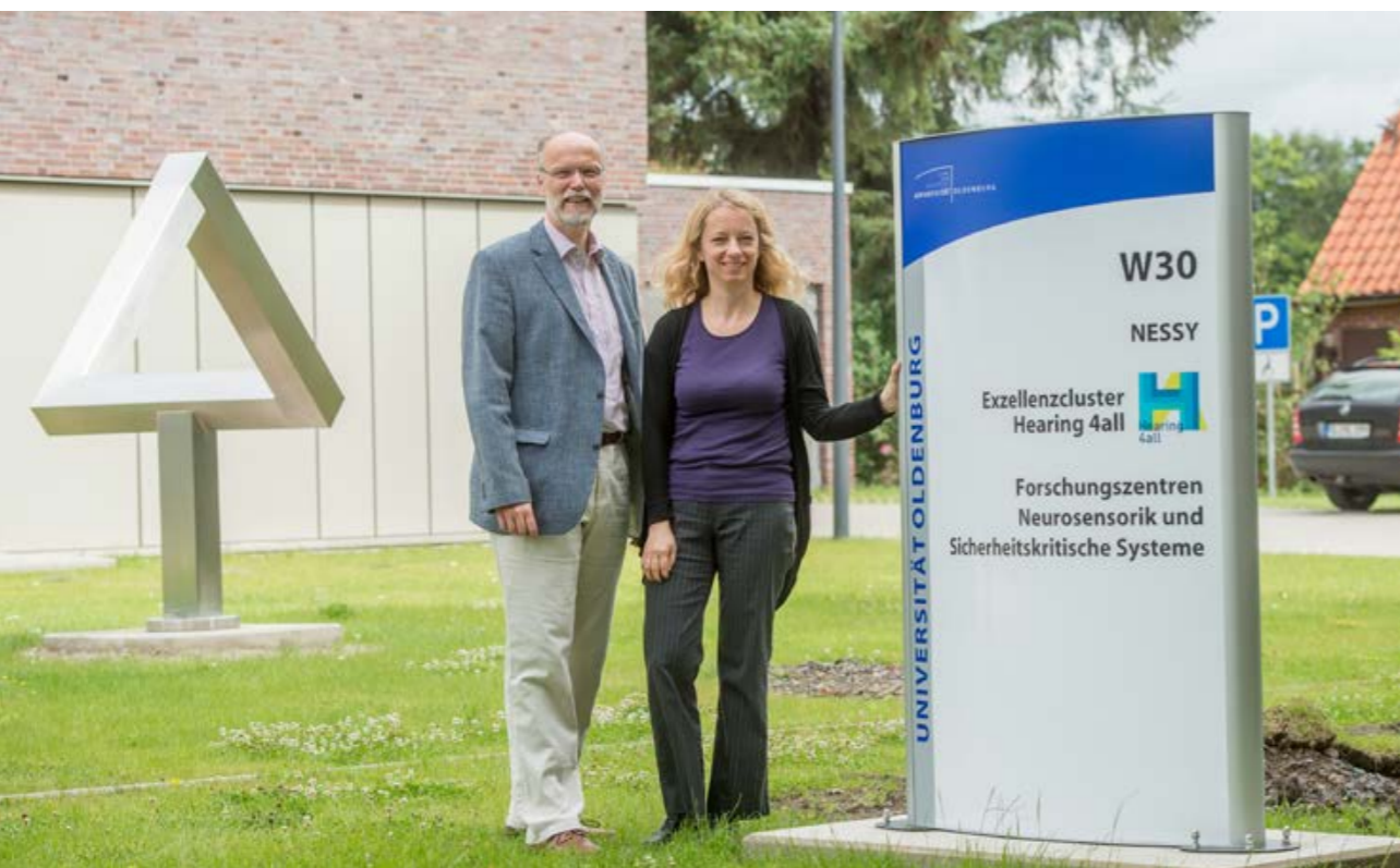
In front of the new NeSSy building: "Two large machines – an MRI scanner and a magnetoencephalography scanner – open up new research questions for us."