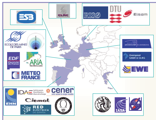
Fig. 3: The project Consortium.

The above range of applications will permit to evaluate in detail the performance of the models developed within the project under various operating conditions. The benefits by the use of a forecasting model will be estimated in two levels: by the use of specific models that simulate the operation of a power system in detail. By this way the monetary value of the forecasts can be estimated (i.e. due to fuel savings) but also their influence to the security of the system. Benefits