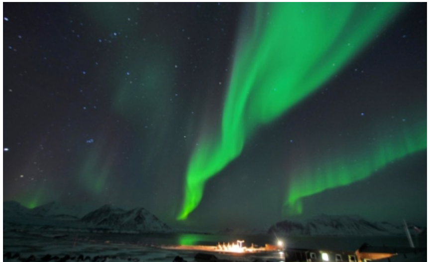
Aurora borealis at the Polish Polar Station Hornsund, Spitsbergen

Centre for Polar Studies is run by the University of Silesia and Polish Academy of Sciences. This joint program of leading Polish universities was awarded with Polish Leading National Research Centre label for 2014-2018. It conducts advanced interdisciplinary studies of the Arctic and Antarctic environment and training of young researchers.