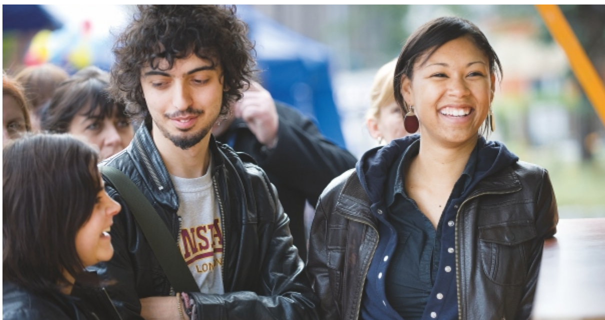
International students during Erasmus Day, Campus in Katowice