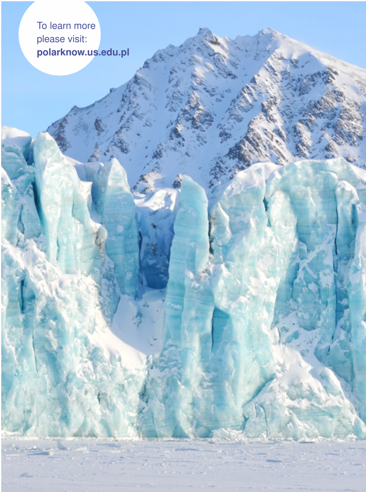
Ice-cliff of Hans Glacier and peak of Fannytoppen in proximity of the Polish Polar Station Hornsund, Spitsbergen

To learn more please visit: polarknow.us.edu.pl