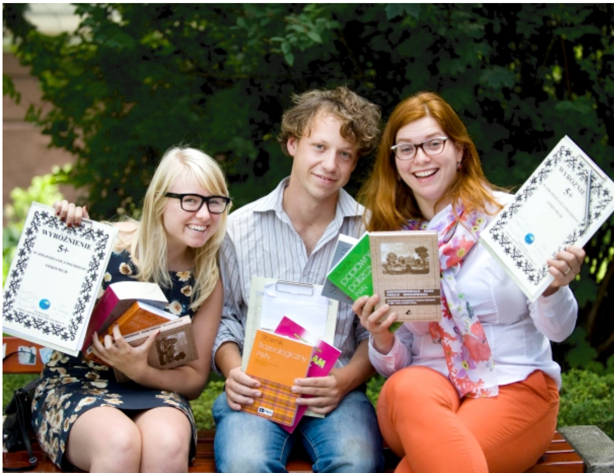
International students during Summer School of Polish Language, Literature and Culture, Campus in Cieszyn

School of Polish Language and Culture , a specialized unit of the University of Silesia, runs a variety of Polish language courses tailored to meet the needs of different learners. Apart from the courses, the School annually organizes the Summer School of Polish Language, Literature and Culture in Cieszyn and satisfies the demand for teachers of Polish as a foreign language by providing post-graduate courses for future teachers. The School cooperates