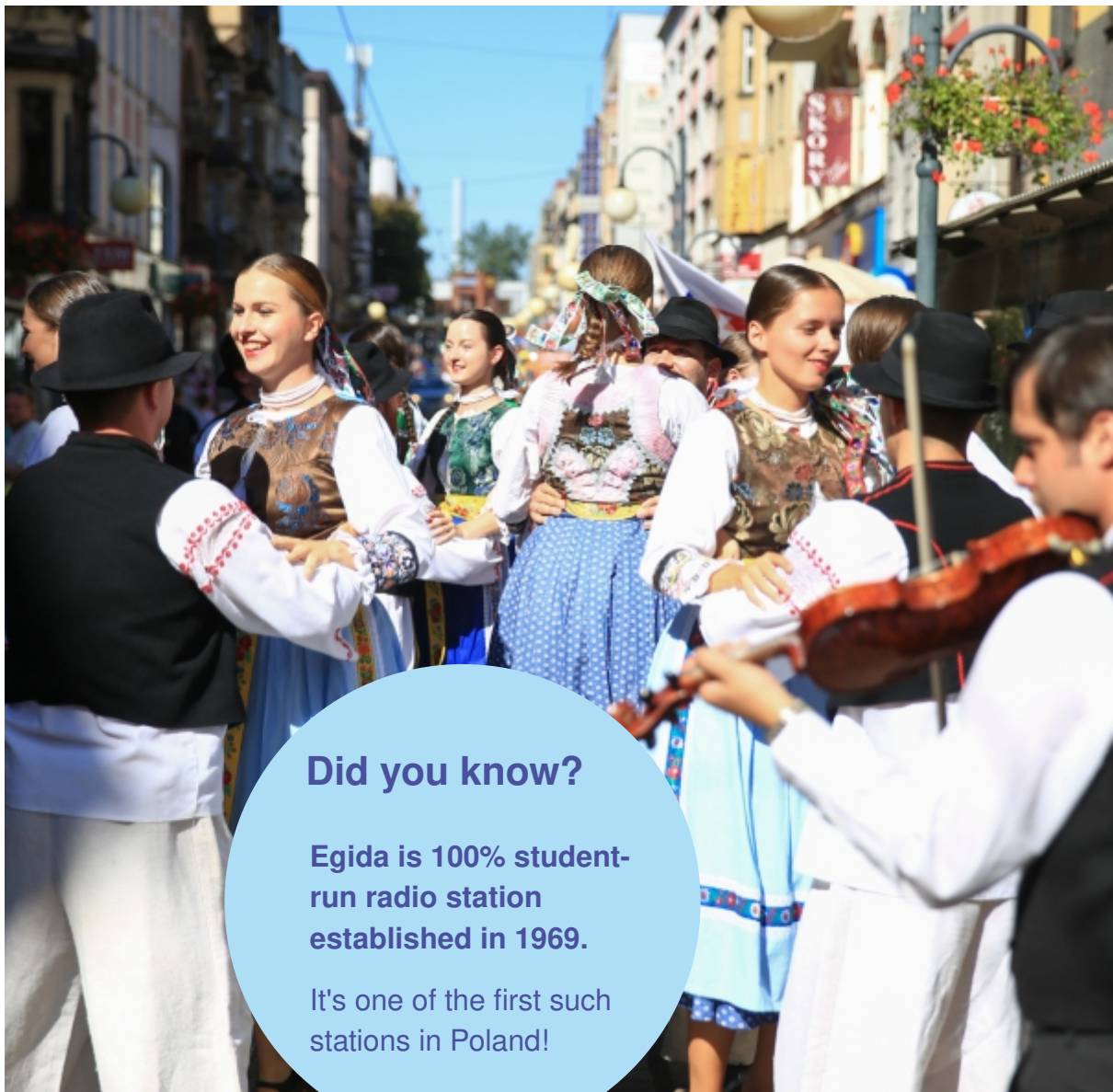
International Student's Folklore Festival, Chorzów