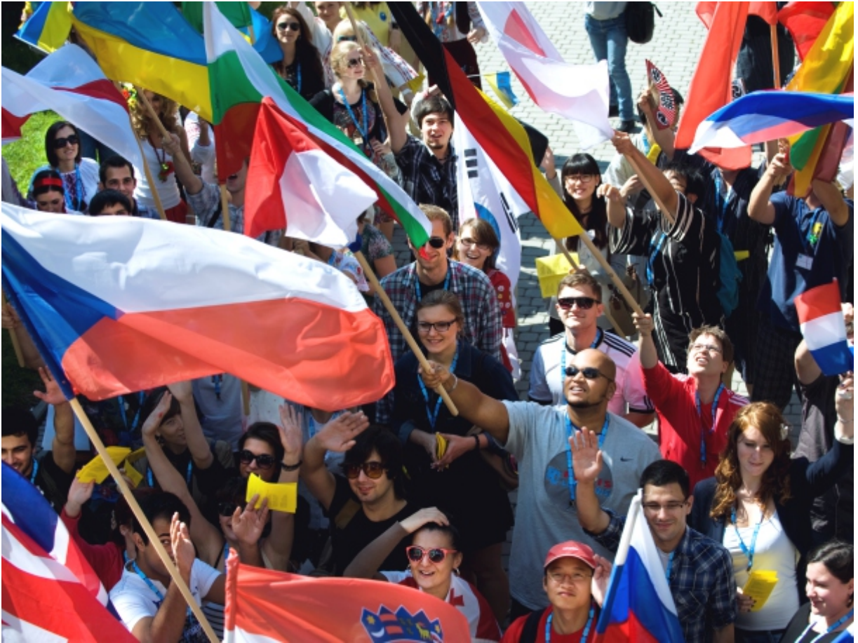
International students during Summer School of Polish Language, Literature and Culture, Campus in Cieszyn