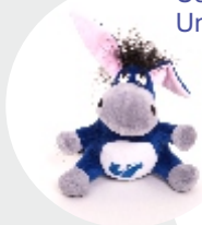
Usiolek [ooshowek] - University's mascot

The mission of the University of Silesia begins with providing a high quality education for its degree program students, but extends well beyond this to function as a meeting point for all members of the local community – regardless of age. That is why at the University of Silesia we have prepared extended educational offerings especially tailored to serve the needs of different age groups.