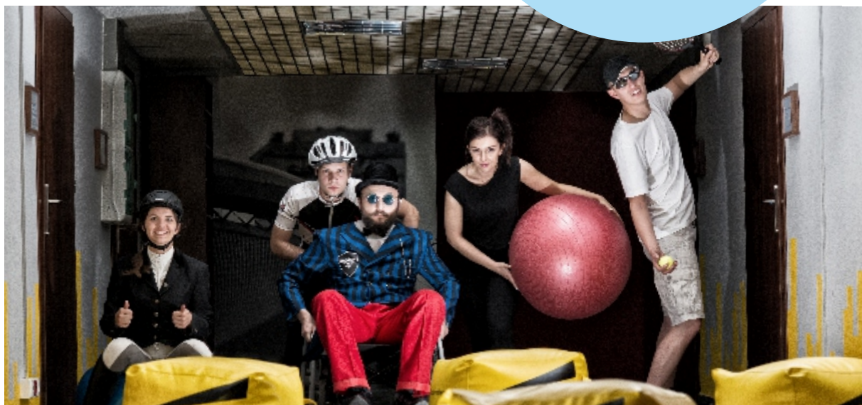
Students of the University of Silesia, Students' Activity Zone, Campus in Katowice

Students' Activity Zone is university's unit devoted entirely to serving the student communities. Incorporating among others Student's Service Center and Career Center, the mission of the zone is not only to support the students in financial, psychological and legal matters, but also to facilitate their entrance and functioning in the labor market. Students' Activity Zone also ensures equal opportunities in terms of access to higher education for people with disabilities.