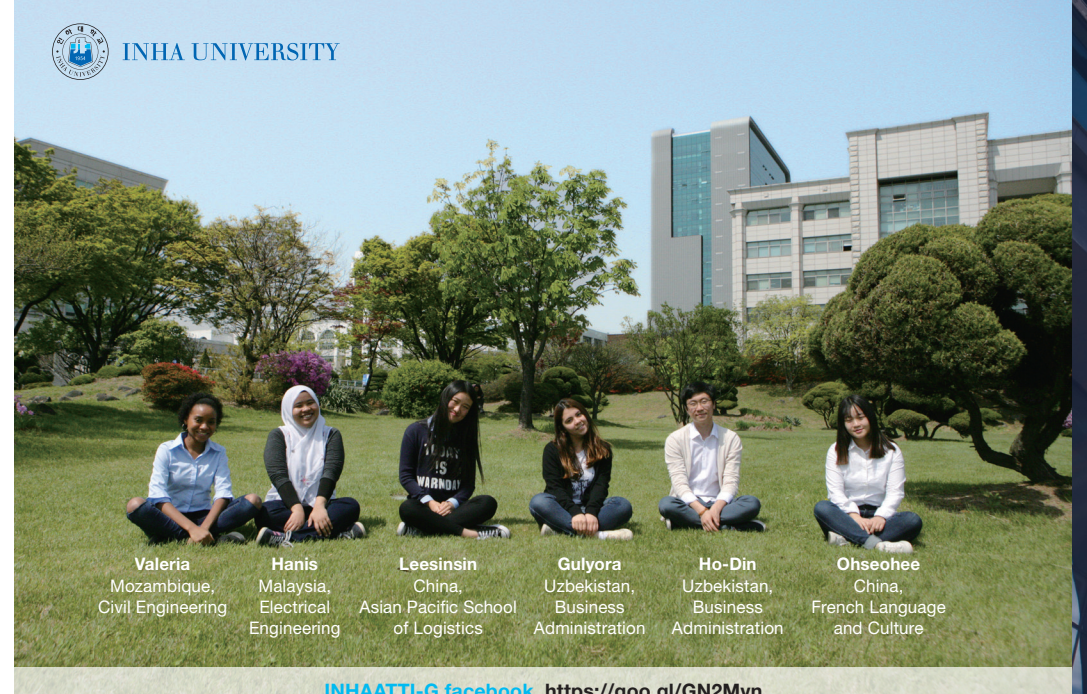
INHAATTI-G facebook https://goo.gl/GN2Mvn