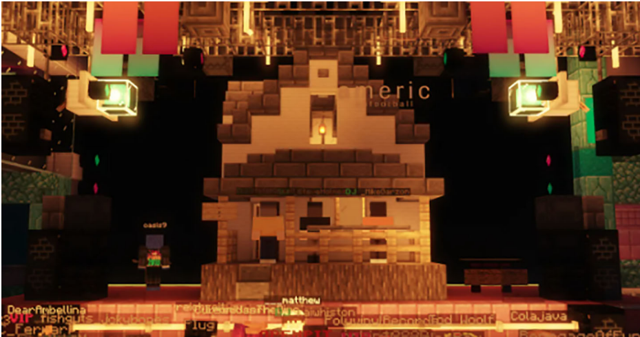
FIGURE 5. American Football's house replica. (Zhang, "How the Hell Do You.")

Artists like Charli XCX, Dorian Electra, and 100 gecs, important names within the genre, are usually on festival lineups.