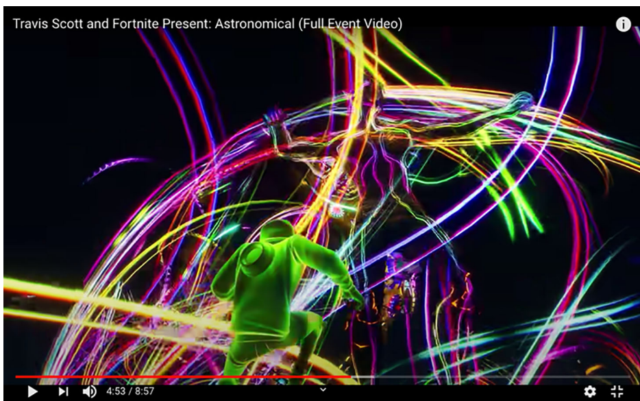
FIGURE 2. Psychedelic colors around the avatars during the concert.

Astronomical changed the paradigm of what’s expected of in-game concerts. Far from being a temporary substitute for in-person concerts that cannot happen during the pandemic, Astronomical presented an innovative way of consuming live music, taking advantage of all creative possibilities that the game environment can offer to the creation of a musical performance. According to Epic Games head of brand Phil Rampulla in an interview with journalist Jordan Oloman, the idea was to make the audience feel like they