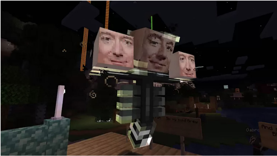
FIGURE 4. Amazon CEO Jeff Bezos as a Minecraft villain.