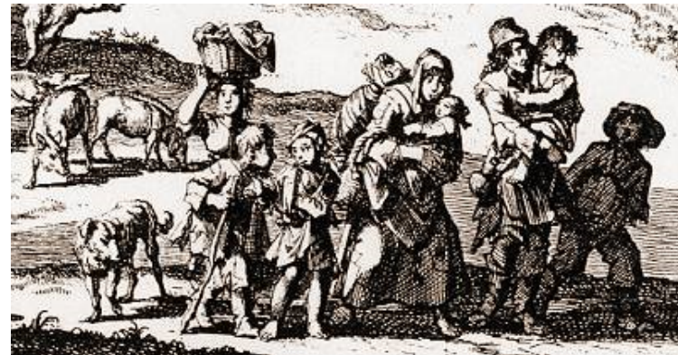
Kupferstich 1696 Jan Luiken

CARL VON OSSIETZKY UNIVERSITÄT OLDENBURG CAMPUS HAARENTOR