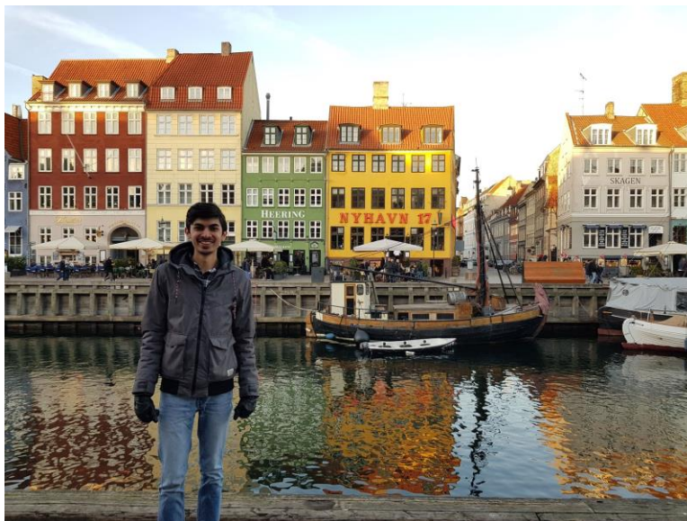
Picture of me at Nyhavn, Copenhagen

Studying at DTU is a definite recommendation from my side. As one gets to experience a beautiful and vibrant city such as Copenhagen nearby and to study at one of the best institutes in the world. One recommendation from my side would be to take the university accommodation on campus if the student is interested in campus life. Or if the city life is more their thing, then definitely living in the city is great. It's best to realize beforehand that living in Denmark is very expensive. I had an expenditure 50% more than I do in Germany, so the Erasmus grant barely covers the surplus of expenses. Another thing student should be open about is biking, as this is very dominant in the Danish society and to fully experience Copenhagen Area, there is no better way than by biking.