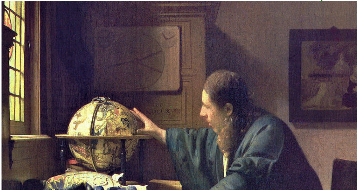
Johannes Vermeer: The Astronomer, 1668, Musée du Louvre, Paris.