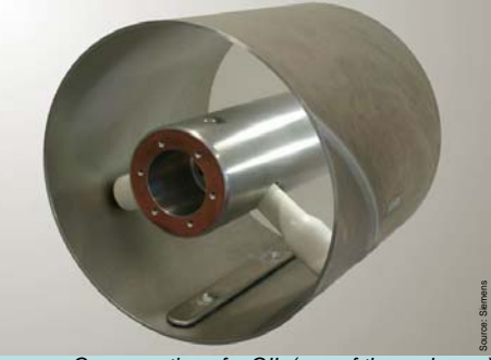
Cross-section of a GIL (one of three phases)

GIL is an AC transmission system for high and extra high voltage. It is based on coaxial pipes of aluminum, with the inner conductor at high voltage centered by solid insulators within an outer earthed enclosure. It is filled with a pressurized insulating gas mixture (80%/20% N/SF6 at 0.7 MPa). Due to its very high conductor cross-section the domain of GIL is high power transmission with currents exceeding 2000 A.