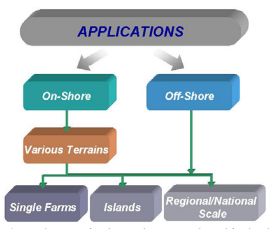
Fig. 2: A wide range of on-line applications is planned for detailed evaluation and optimal exploitation of the results.

requirements. A potential user will be able to select the most appropriate ones and tailor the prediction platform to a specific application. Potential users of the platform can be IPPs, Energy Service Providers that may use the platform as a Prediction Service; utilities, TSOs, DSOs and others.