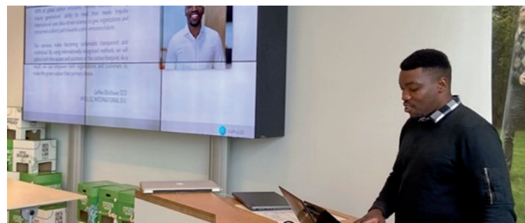
Start-up Impulse presenting