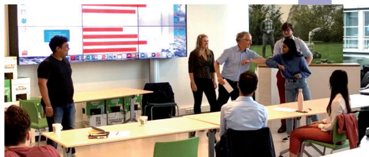
Circular Challenge on-site Twente