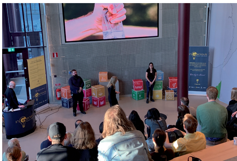
Final pitch in the inGenious Course

It is crucial that the challenge providers are genuinely interested in the students, their knowledge, and their way of thinking outside the box when being innovative. This type of collaboration is an excellent way for companies to get in touch with academia, get help being more sustainable, and find future employees. At the same time, the students learn that there is a huge and interesting labor market in the region. Students are challenged to operate outside of their comfort zone, resulting in more self-confidence.